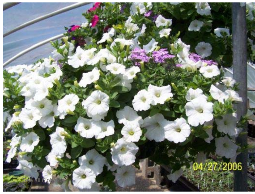
A white wave petunia hanging basket. Notice how compact and full the plant is as well as the profusion of blooms.

During my time as a greenhouse owner I had numerous customers come to my place looking for something easy to grow that would be hard to kill. Obviously, with any plant, there is the potential to not meet some of its need and cause it to stop living, but over time I realized there was one that was preferred over most others, the wave petunia. This easy growing plant is a great starter plant for any novice flower gardener.