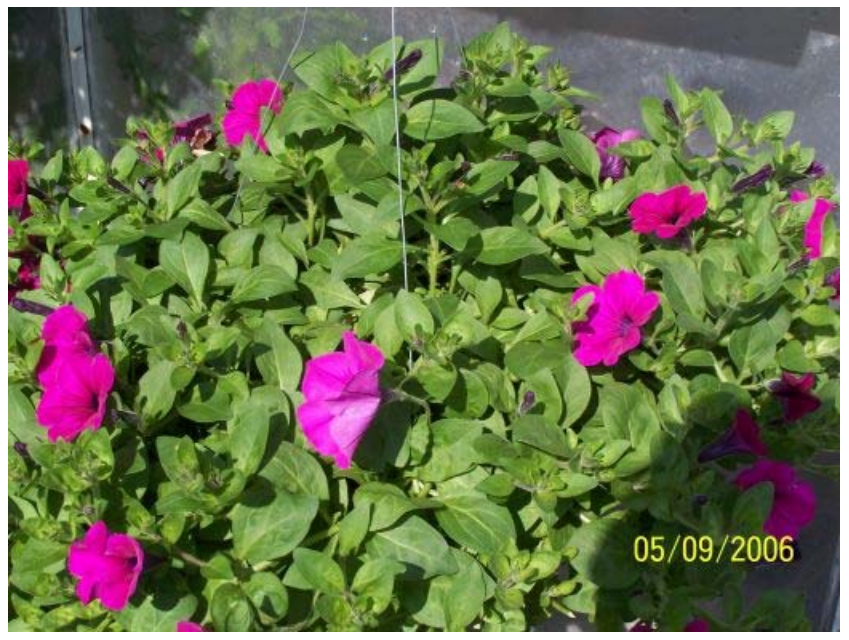
A pink wave petunia basket just beginning to bloom. Notice the deep green foliage.