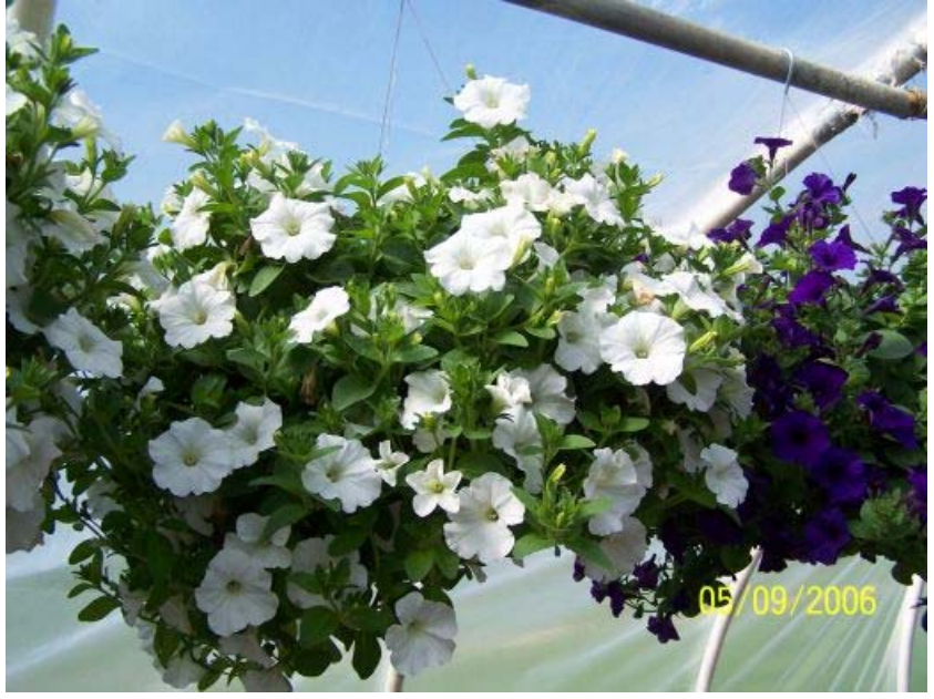
This is another white wave hanging basket. These plants were watered each day with a water soluble fertilizer.

• The Gardener's Companion - Using a string trimmer to keep your yard in check