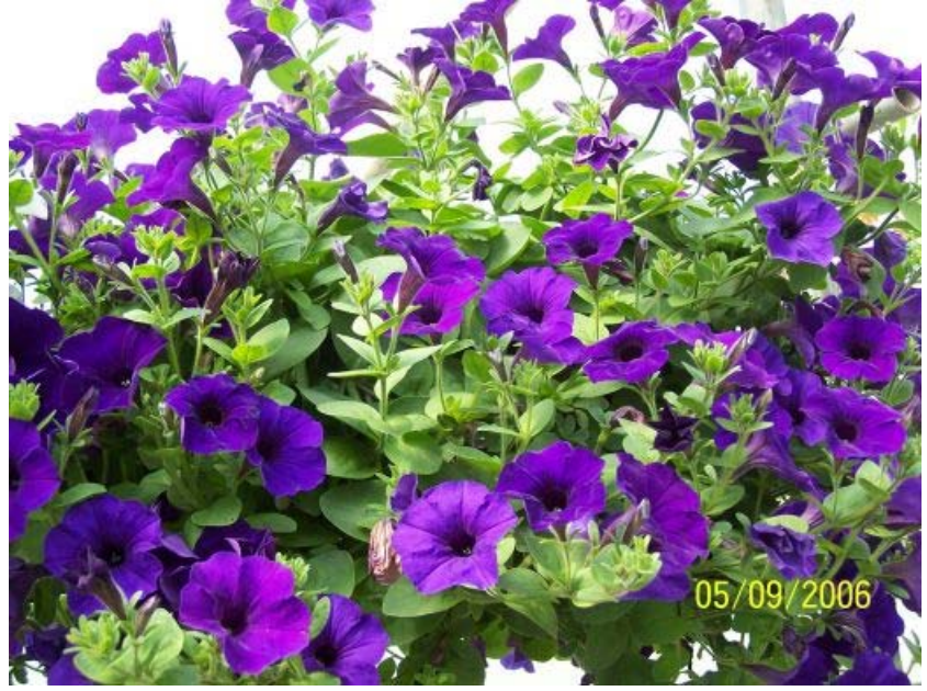
A purple wave petunia basket.