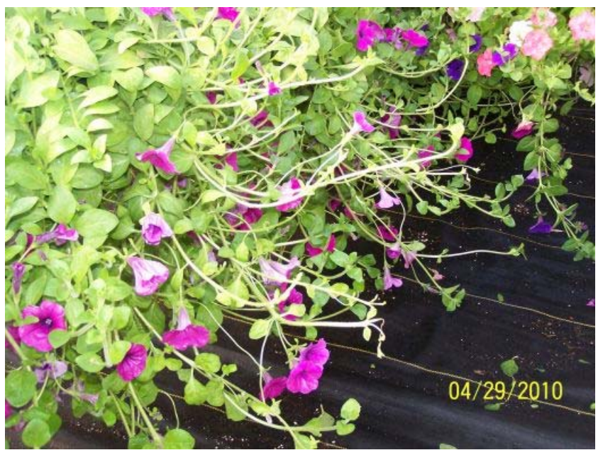
Example of a wave petunia not pinched correctly. Notie the long, lanky branches that cause the plant to be asymmetrical.